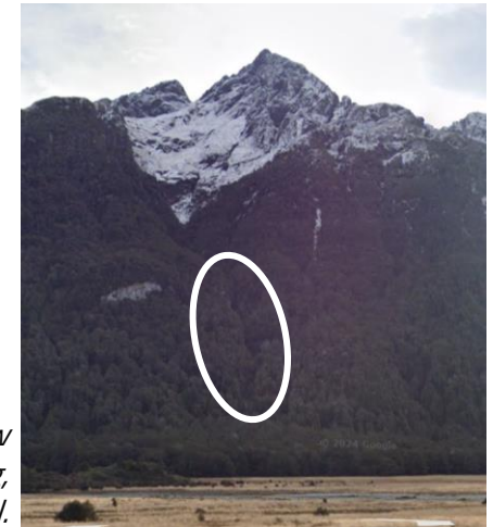
Knobs Flat Creek below Largs Peak, intimidating, with potential.

https://www.kiwicanyons.org/knobs-flat-creek https://maps.app.goo.gl/Q22sFcoDDSCW2eTY7