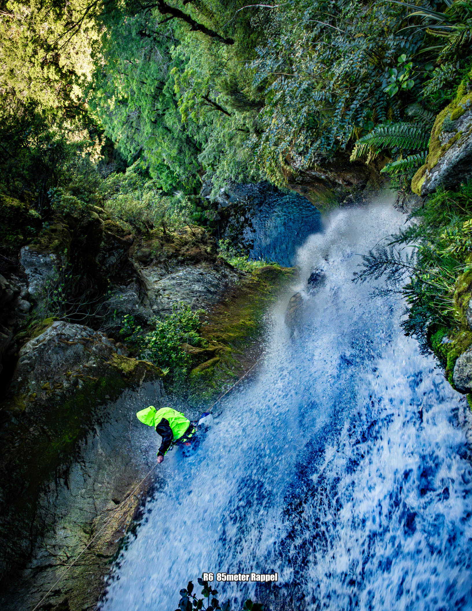
R6 85meter Rappel