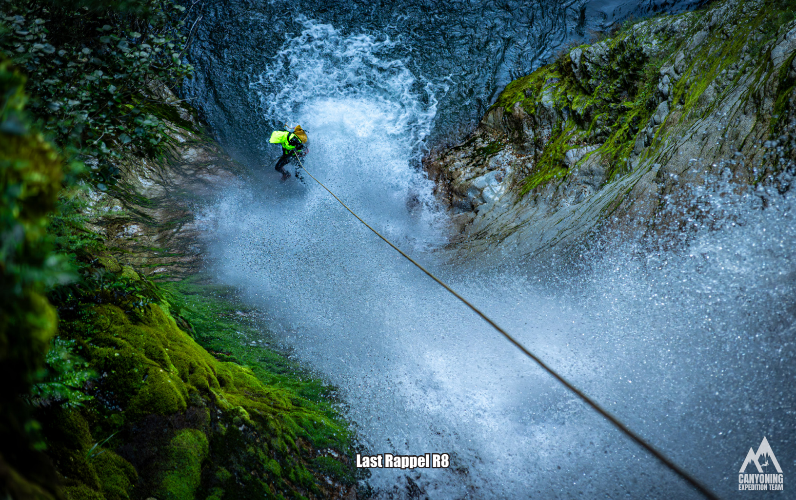
Last Rappel R8