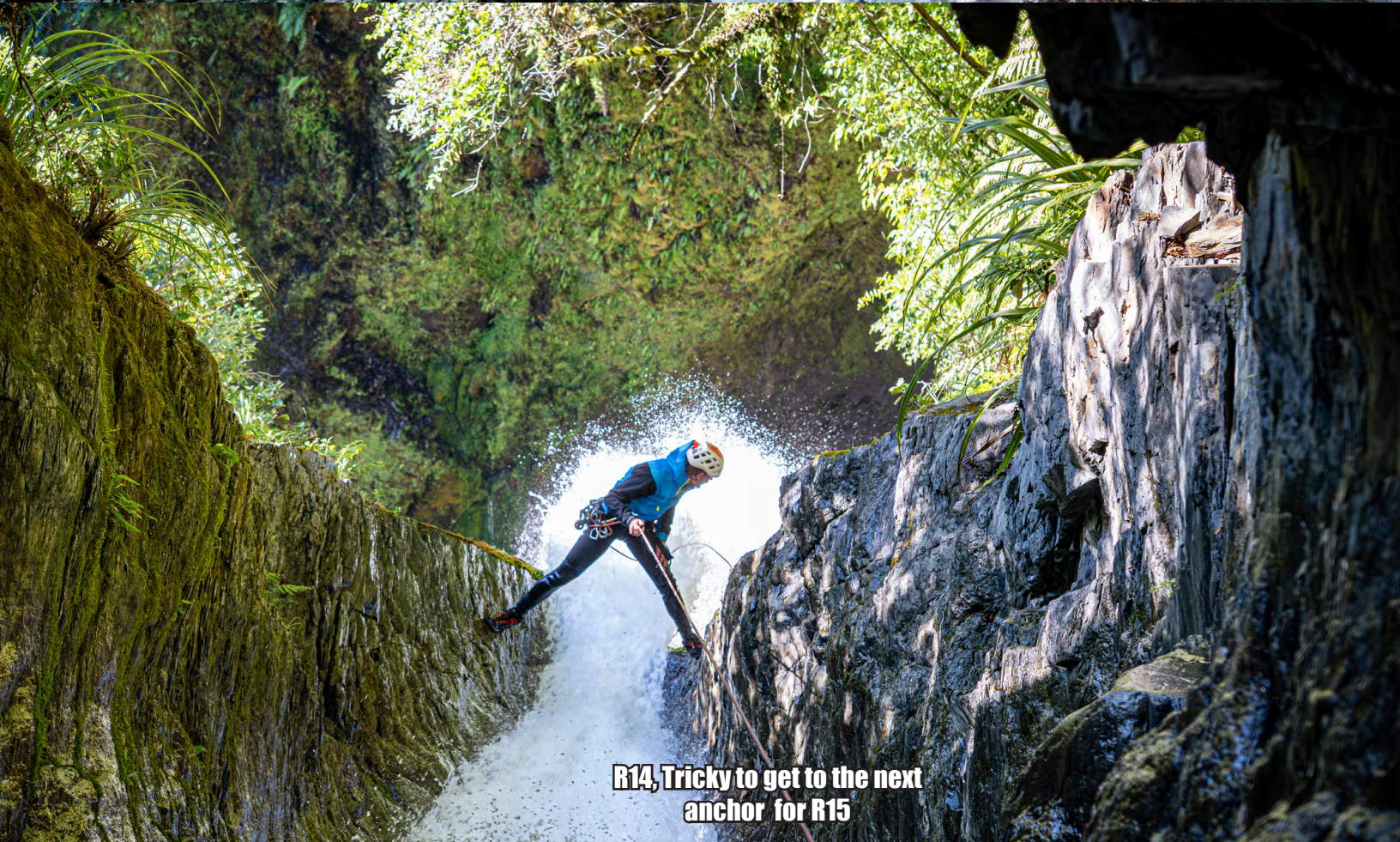
R14, Tricky to get to the next anchor for R15