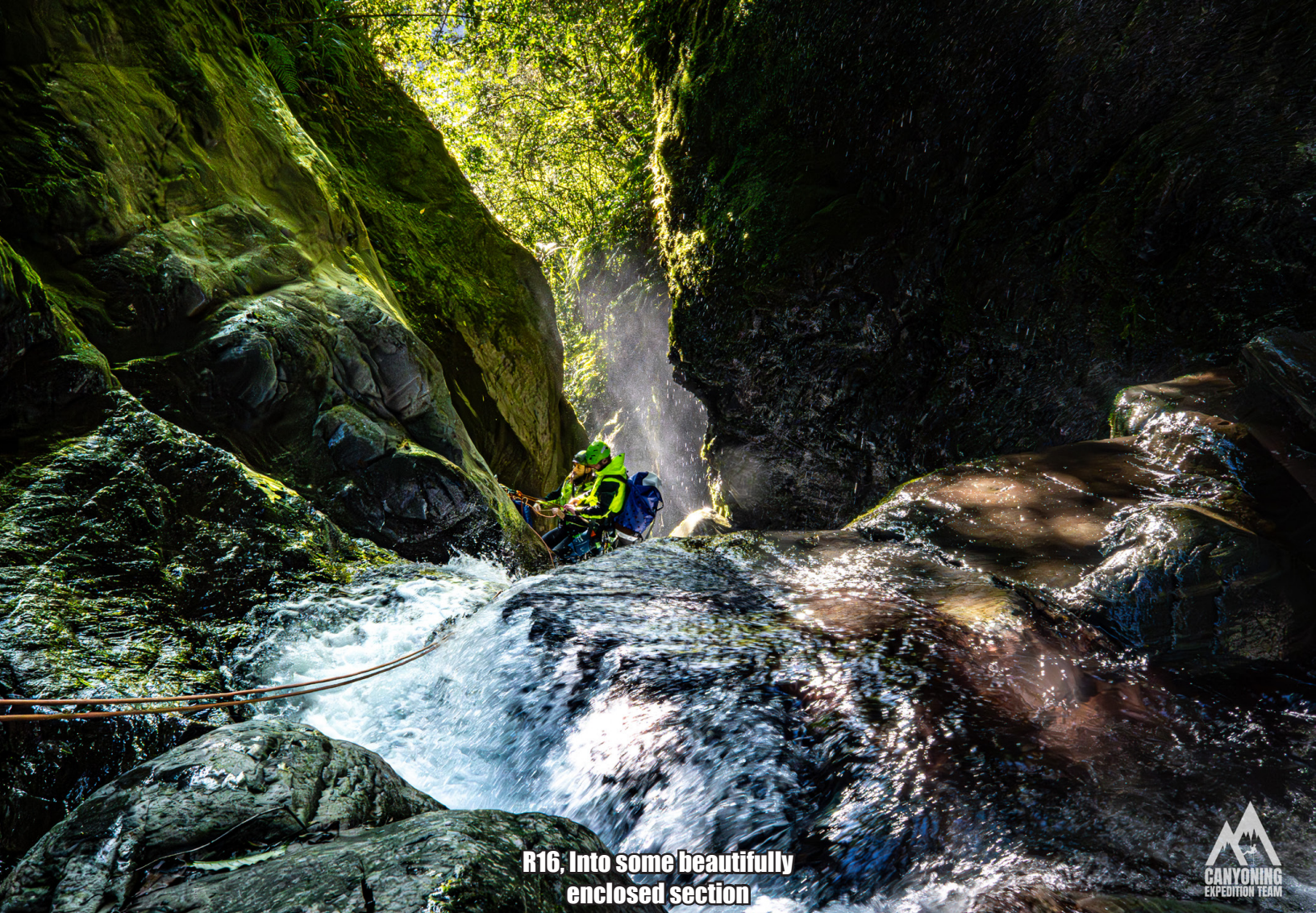
R16, Into some beautifully enclosed section