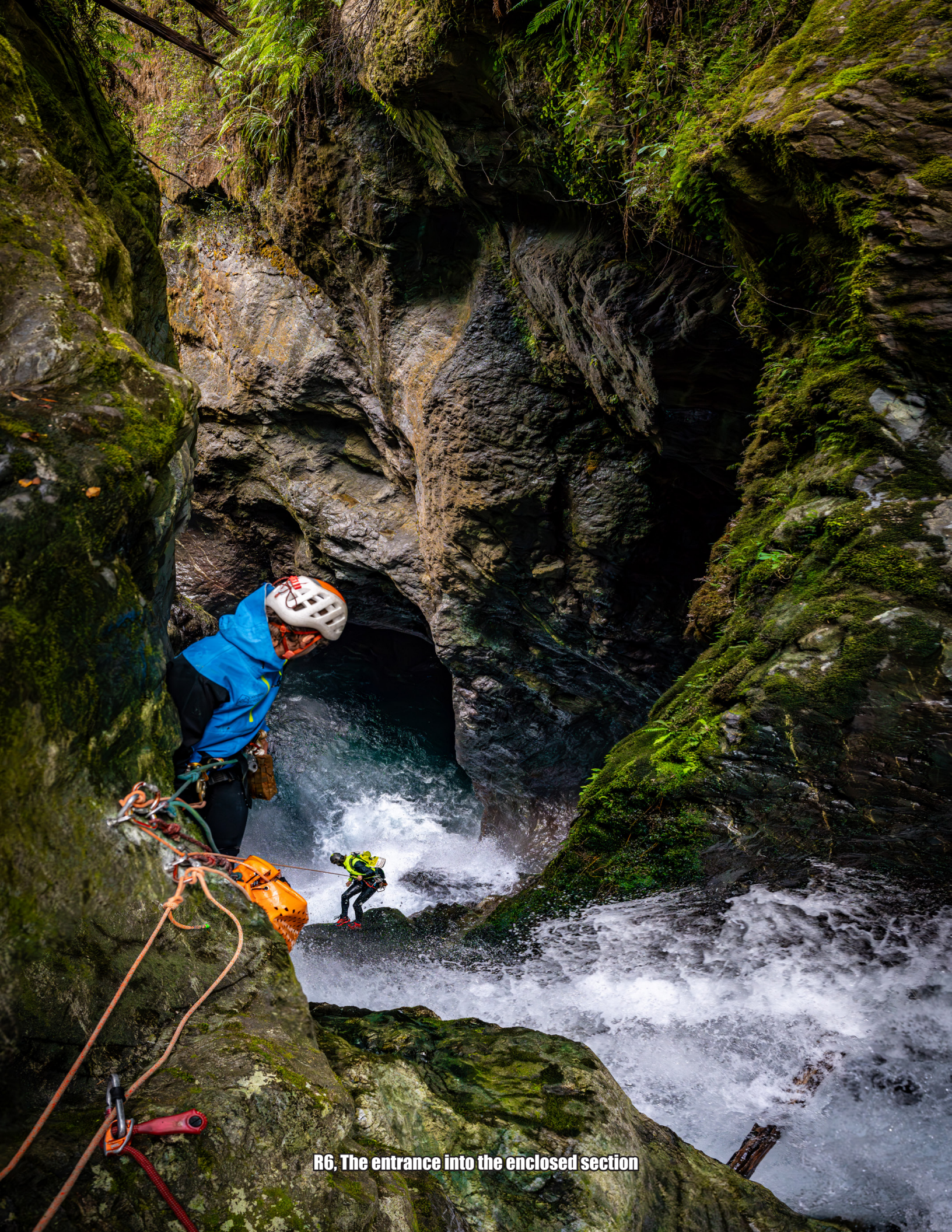
R6, The entrance into the enclosed section