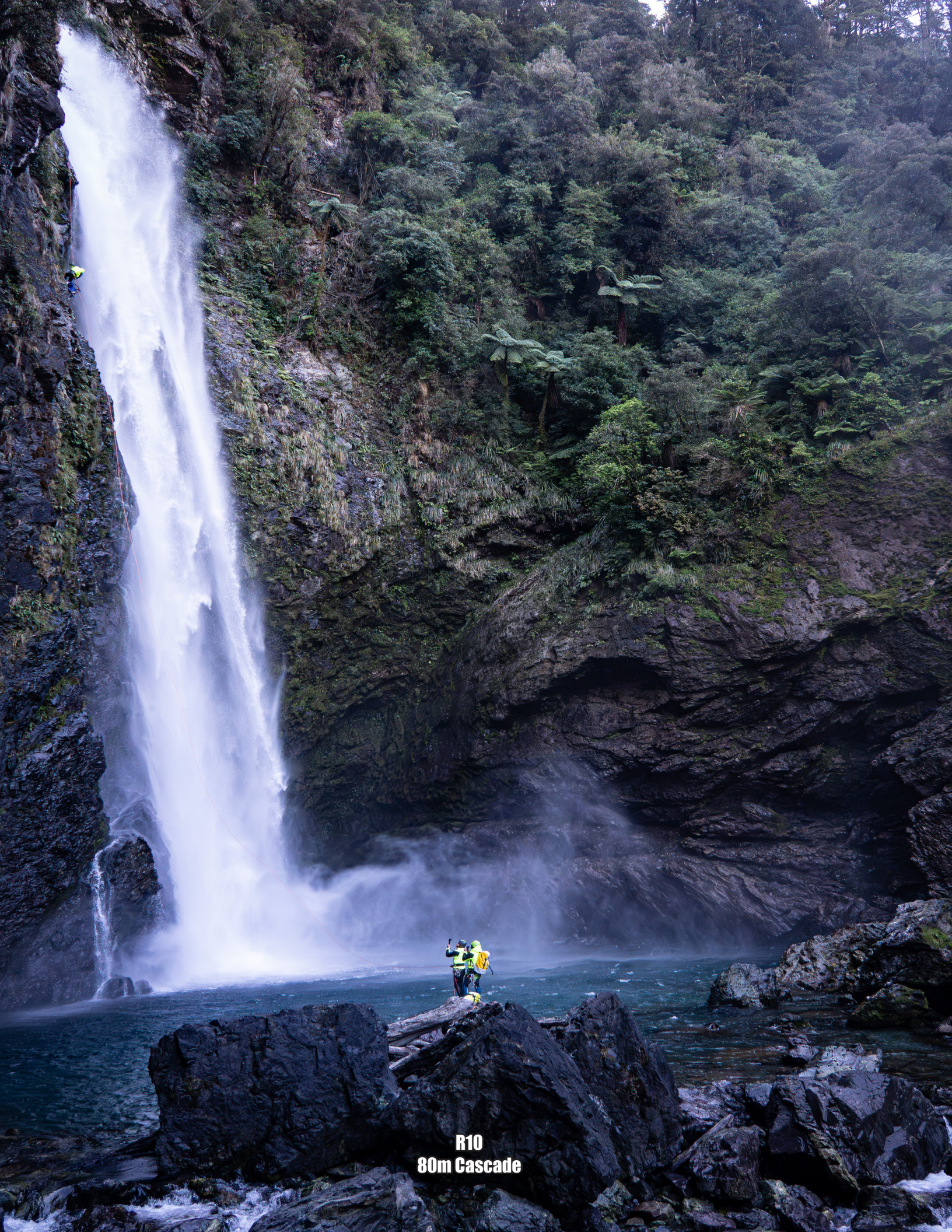
R10 80m Cascade