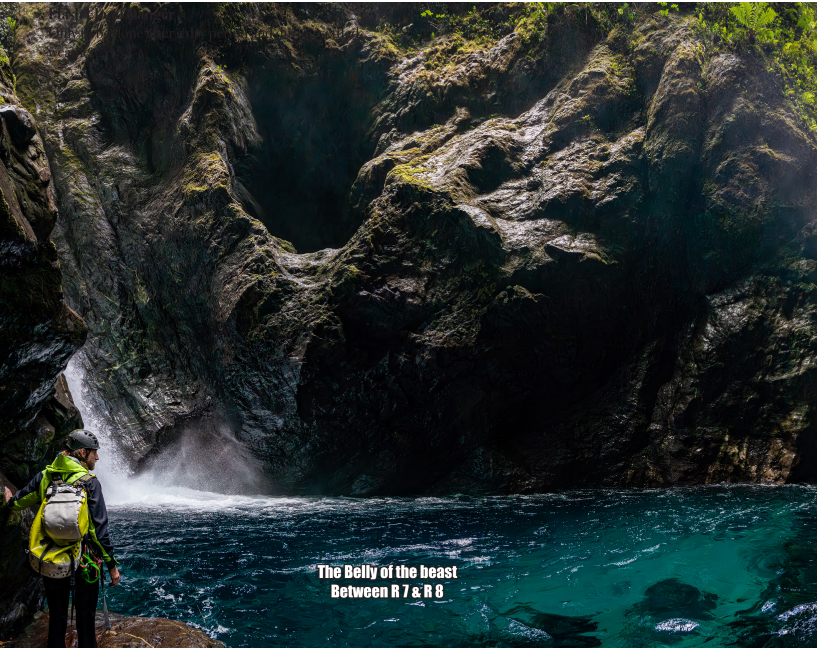
The Belly of the beast Between R 7 & R 8

An excellent adventure in a remote setting. A very rewarding adventure!