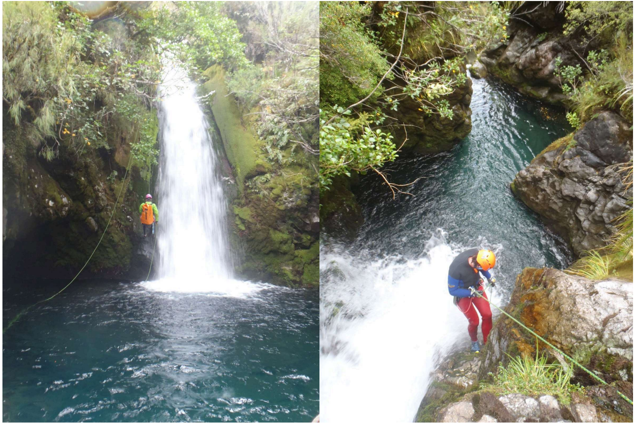
R5 and R6: Deep blue pools.