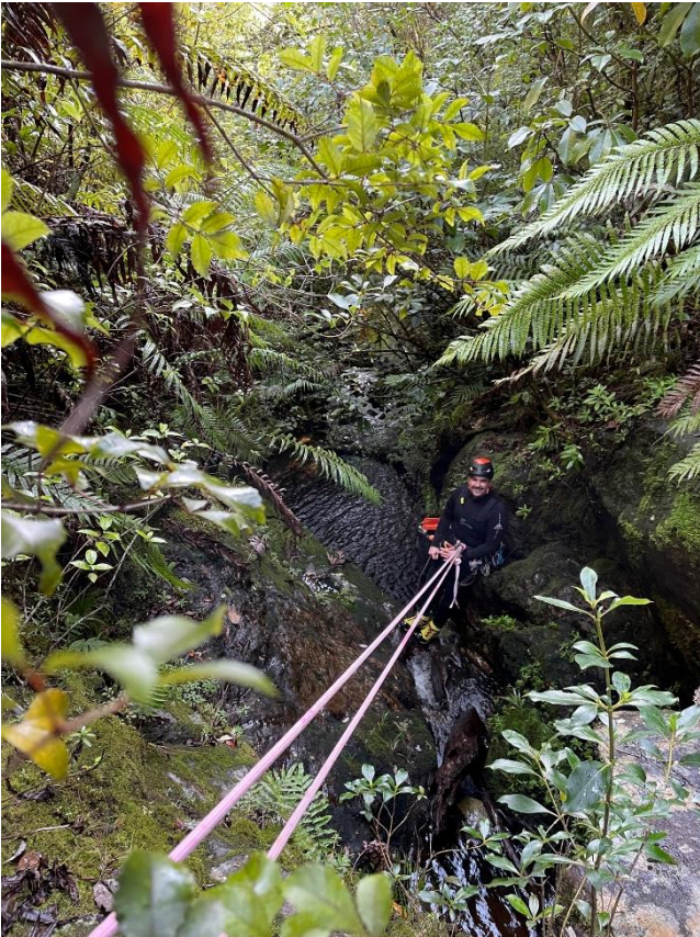
Rappel in upper section