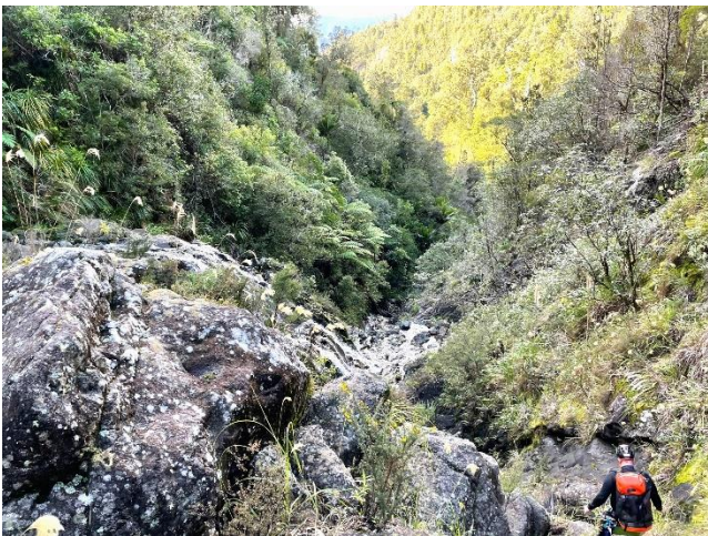
60m waterfall – unfortunately just a wide cascade which you can climb down