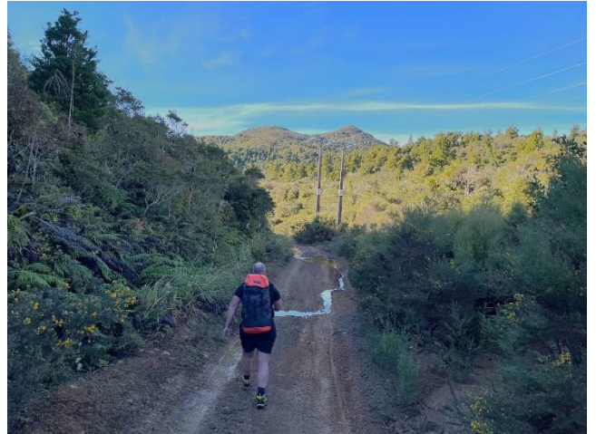
Following the 4WD track to Neavesville. This is used by the power line maintenance crews.