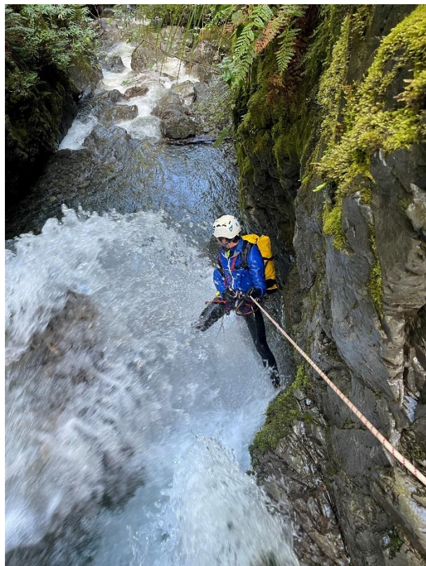
R3, contemplating the overhanging drop off.