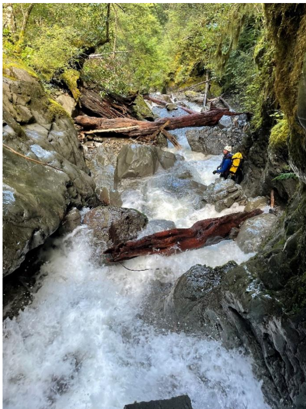
Down climbs above R2 (suspended log anchor).