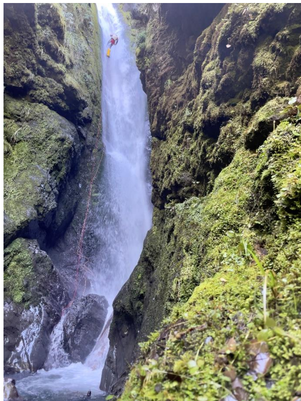
R1 working to avoid a pounding.