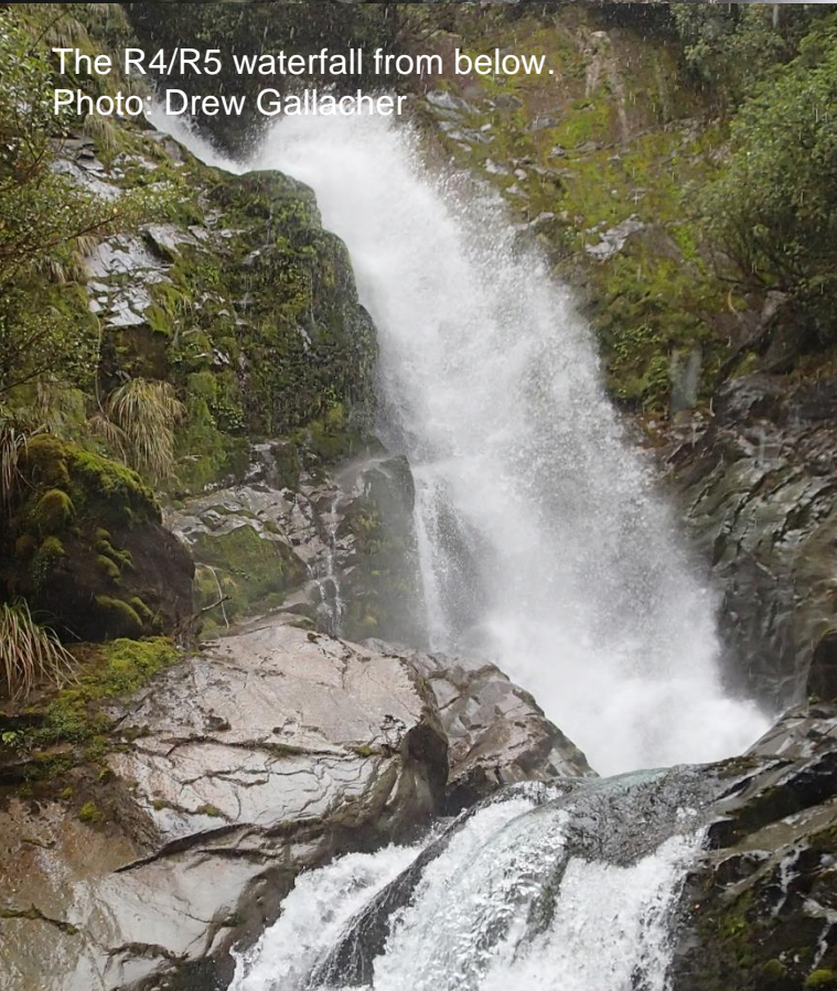
The R4/R5 waterfall from below.