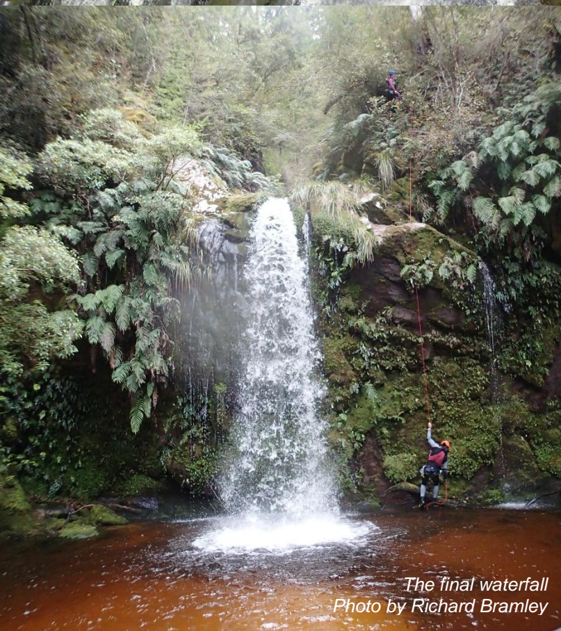
The final waterfall