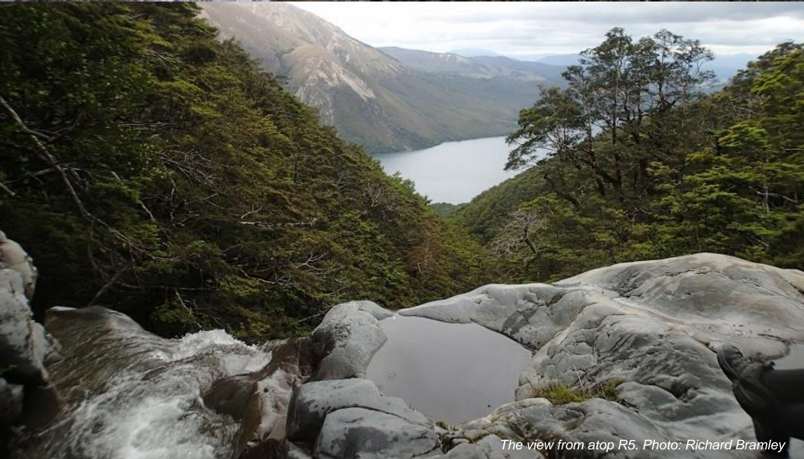
The view from atop R5.