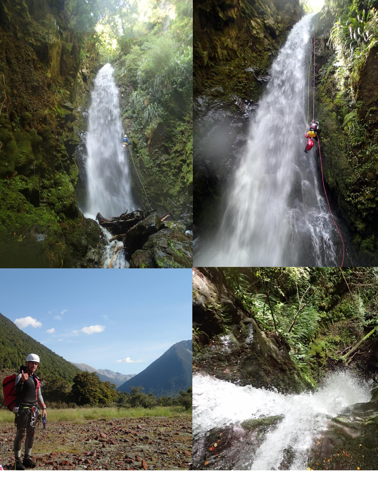
CLEARWATER Stream v3a2III ★